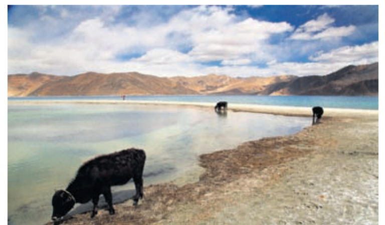
In this Sept. 14, 2018, file photo, cattle drink water at Pangong Lake, the site of several confrontations between India and China in Ladakh region, in Ladakh, India.

Indian officials say Chinese soldiers entered Ladakh in early May at three different points, erecting tents and guard posts and ignoring verbal warnings to leave. That triggered shouting matches, stone-throwing and fistfights, much of it replayed on television and social media. In all, China claims some 90,000 square kilometers (35,000 square miles) of territory in India's northeast, including the Indian state of Arunachal Pradesh, with its tradition-